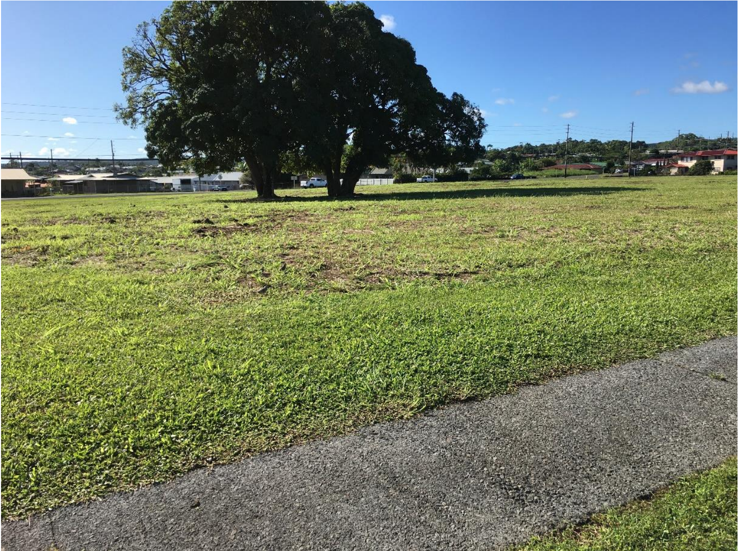
From Northeast corner looking Southwest.