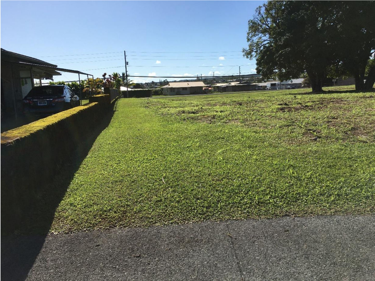
Eastern boarder looking North to South from Kilaha St.