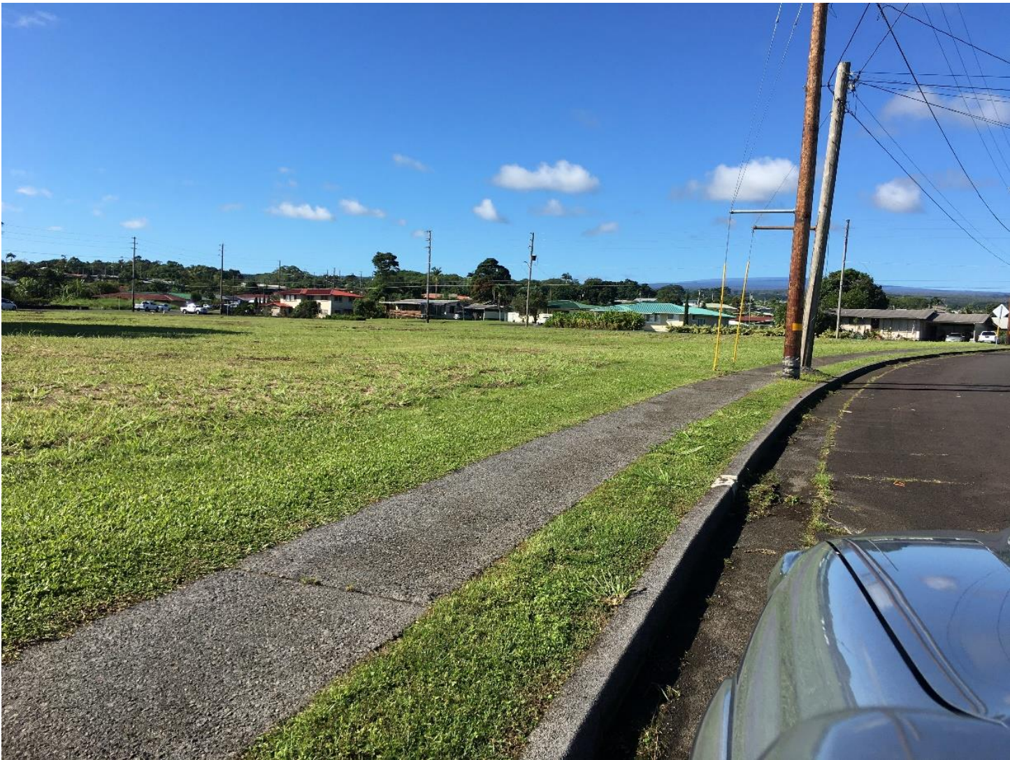
Northeast corner looking West along Kilaha St.