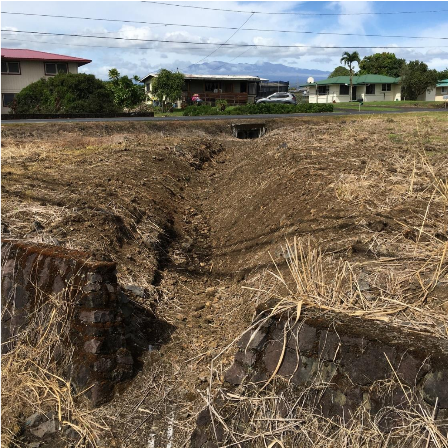
Unconfined drainage ditch at Southwest corner of property